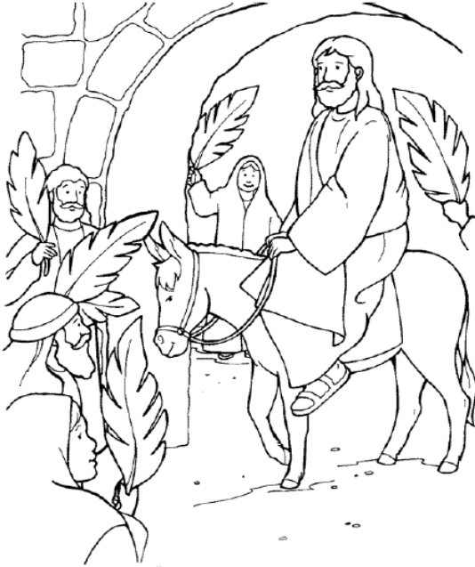
Jesus rode into Jerusalem